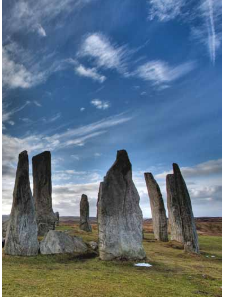
Standing stones in Callanish, the Outer Hebrides.

Paganism, with its roots in the indigenous, pre-Christian religions of Europe, has evolved and adapted to the circumstances of modern life. Its re-emergence in Scotland parallels that observed in other Western countries, where it has been growing rapidly since the 1950s. The social infrastructure of Paganism reflects the value the community places on unity in diversity, consisting of a polycentric network of interrelated traditions and local groups served by a number of larger organisations. In Scotland the Pagan Federation acts as an educational and representative body liaising with government and other relevant bodies on behalf of the Pagan community.