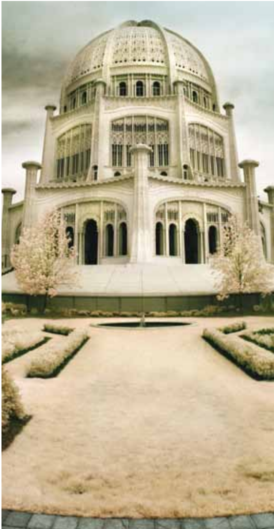
The Baha'i Temple, New Delhi, India.

The Baha'i Faith began in Persia on 23rd May 1844, when a person known as the Bab (Gate) proclaimed that he was a Messenger from God and also the herald of 'the Promised One', a messenger greater than himself. He and his followers were severely persecuted by the Persian authorities and the Bab was finally executed in 1850.