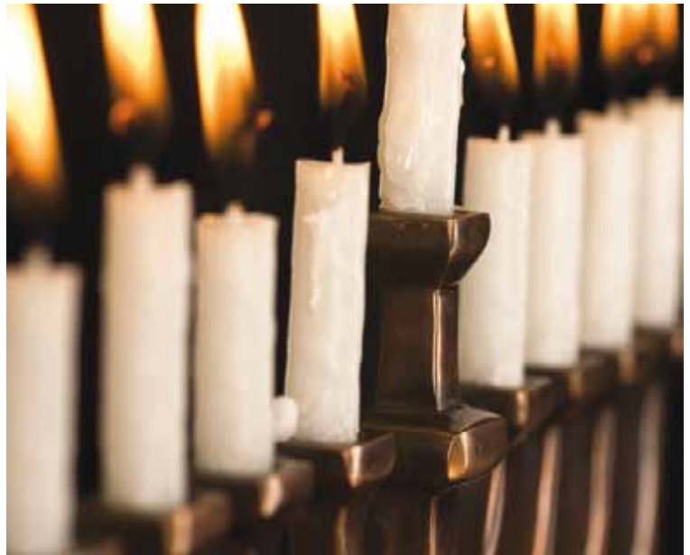
Beautiful lit Hanukkah Menorah.

All males and married females are required to cover their heads inside the synagogue. In an orthodox synagogue, men and women sit separately whereas in liberal or reformed synagogues, they sit together.