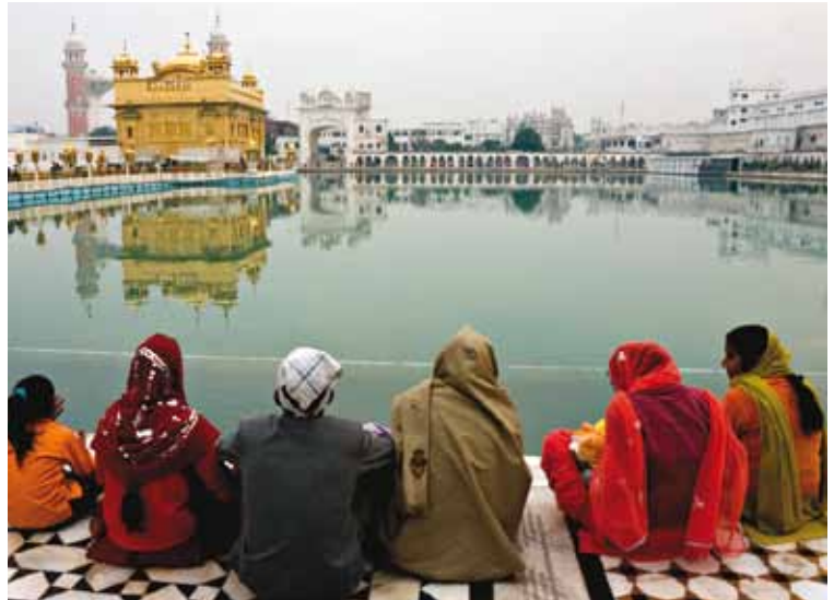
The Harmandir Sahib (The Golden Temple) at Amritsar, India.

The Sikh faith is a distinct religion revealed through the teachings of the ten Gurus, the first of whom was Guru Nanak Dev Ji. He was born in 1469 CE in the Punjab, India. In 1708 the tenth and the last Guru in human form, Guru Gobind Singh Ji, vested spiritual authority in the Holy Sikh Scriptures known as the Guru Granth Sahib Ji and temporal authority in the community of initiated Sikhs, the Khalsa Panth.