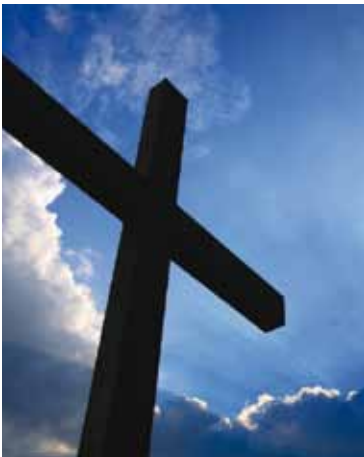
Christian crosses symbolise the crucifixion of Jesus Christ.

Christianity was founded in what is today modern day Israel and Palestine around 2000 years ago. It is based on the teachings of Jesus of Nazareth, known as Christ. This means 'the anointed one', and Christians believe Jesus to be the Son of God. Christians see themselves as following in the way of Jesus who revealed the forgiving love of God for all people and God's concern for human beings.